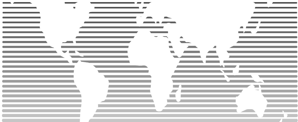
FIGURE 1. Localization of the sites in the Czech Republic